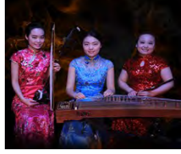
Indulge in the best Chinese instrumental performance by the dazzling Trio.