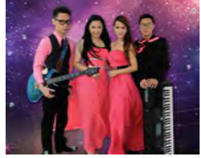
Enjoy the music of different genres.