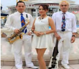
Experience enchanting music with the Trio!