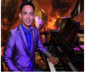
A night of music and melody which will captivate you.