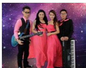
Enjoy the music of different genres.