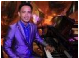
A night of music and melody which will captivate you.