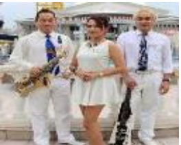
Experience enchanting music with the Trio!